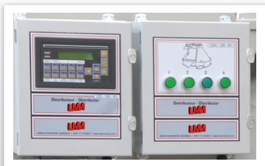
PLC Controller (optional)